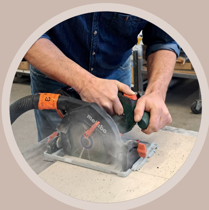
⇒ CUT WITH CIRCULAR HAND SAW

ORDERING INFORMATION: SUPER EASY FIREPLACE CONSTRUCTION BOARD Item number: 776754, 1 pallet = 18 pieces