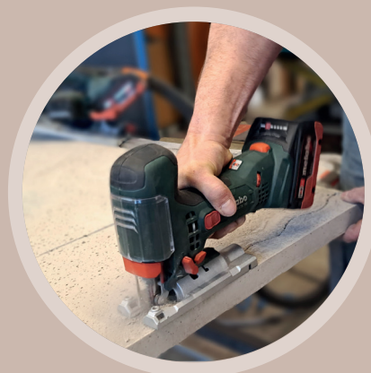
⇒ CUT WITH KEYHOLE SAW